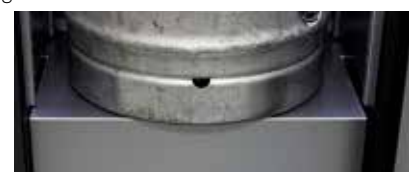
OPTIONAL : KEG SUPPORT FOR 30L KEGS